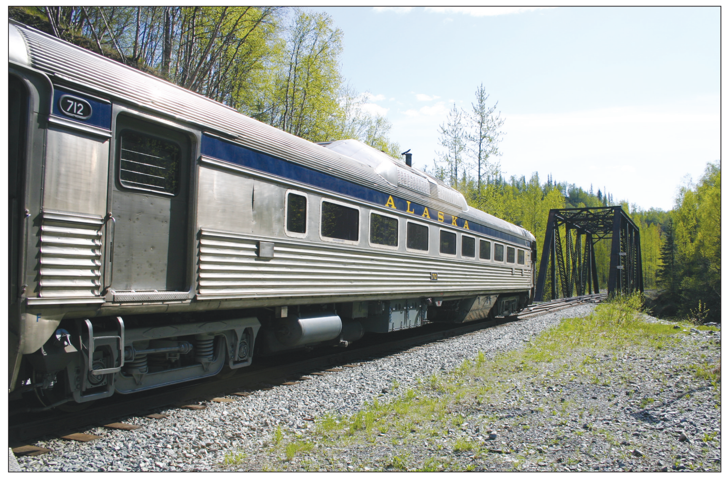
Alaska Railroad Budd RDC2 No.712 at the prime fishing spot at Indian River.

Pacific main line between the nickel mining town of Sudbury Ontario and the small town of White River Ontario which claims to be both the coldest place in Canada and the hometown of Winnie The Pooh!