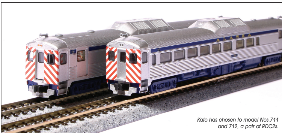
Kato has chosen to model Nos.711 and 712, a pair of RDC2s.

This fine Kato model features a smooth running motor drive placed below window level which means the windows have full visibility through the entire length of the coach along with upstanding seat back detail. It has prototypical drive shafts driving the bogies, a detailed underbody and directional constant intensity lighting including head and tail lights at both ends. Few HO or OO DMU models can claim even that; add to that space for a drop-in DCC decoder from Digitrax designed specially for the model (DN122K2), and a snap-in interior LED lighting kit (No.11-209) from Kato with a choice of fluorescent or incandescent colour filters. This model really does set the standard for ready-to-run DMU models.