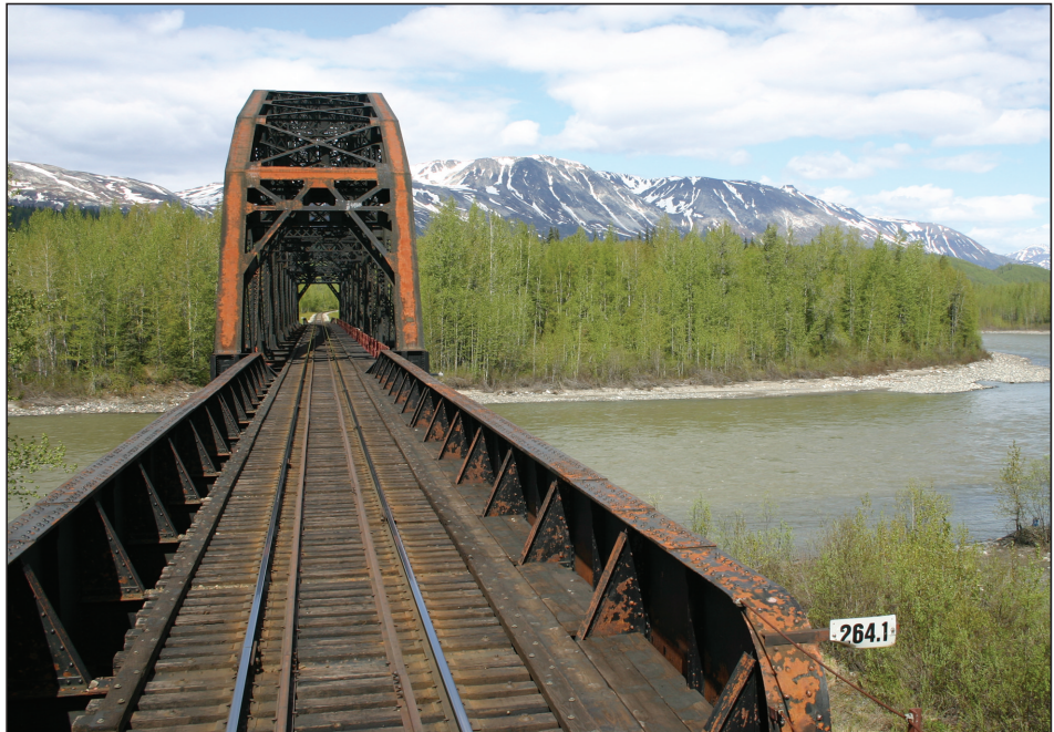
The 1920-built steel bridge over the Susitna River seen from the cab of RDC3 No.701 at Milepost 264. Note the weathering effects on the steel structure.

Models of the Budd RDC are available in most scales, and in a wide variety of road names – one of their beauties for the modeller is that they fit any era from the steam-diesel transition periods of the 1950s right up to the present day, and were owned by railroads all over North America – if the railroad you model didn't have them, then their neighbour almost certainly did. In N scale, Kato are the main source with an extensive range that includes all four original variants of the RDCs – 1,2,3